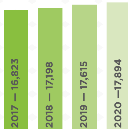
LABOR FORCE TOTALS