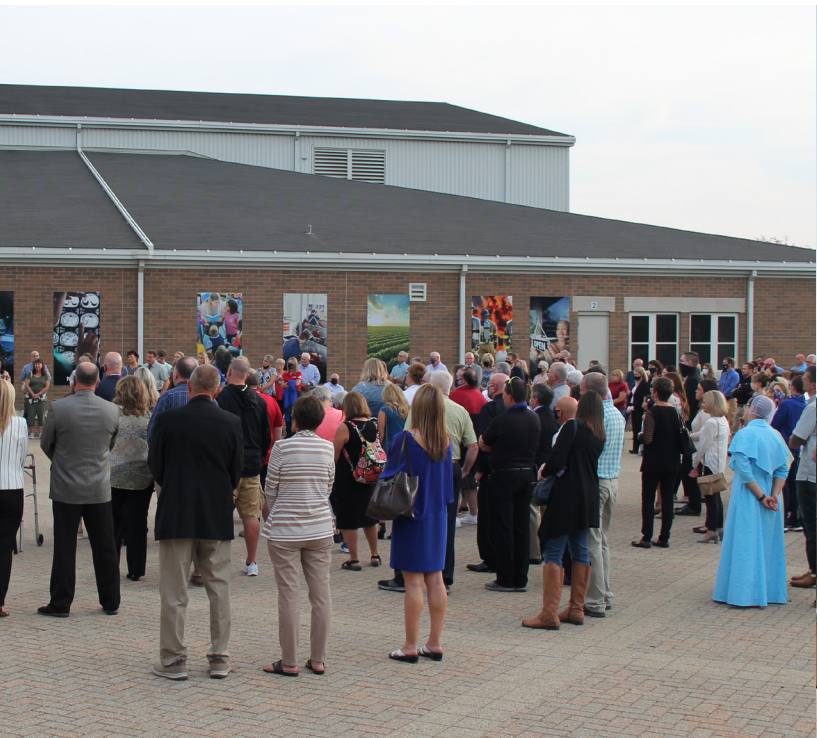
The public gathers for Whitko Career Academy's Open House.