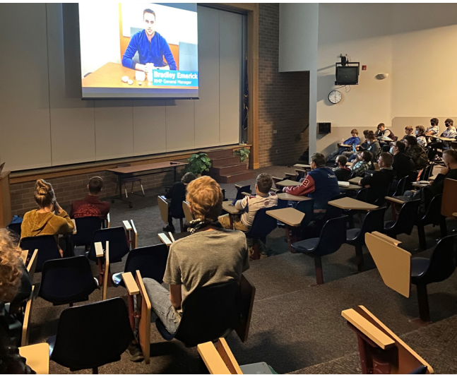
Schools watch a video from Whitley EDC for a virtual Manufacturing Day 2020.