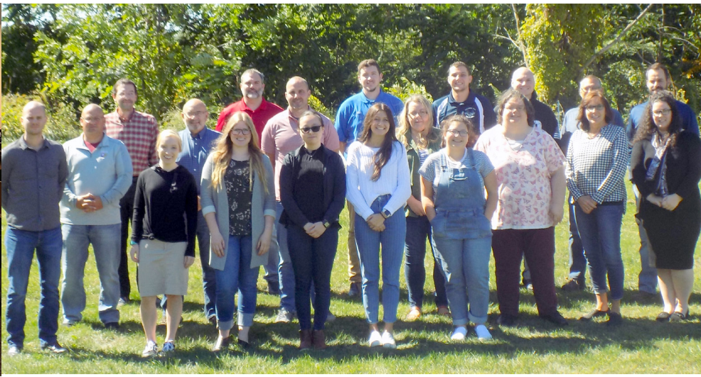
Leadership Whitley County celebrates the program's 20 year anniversary.