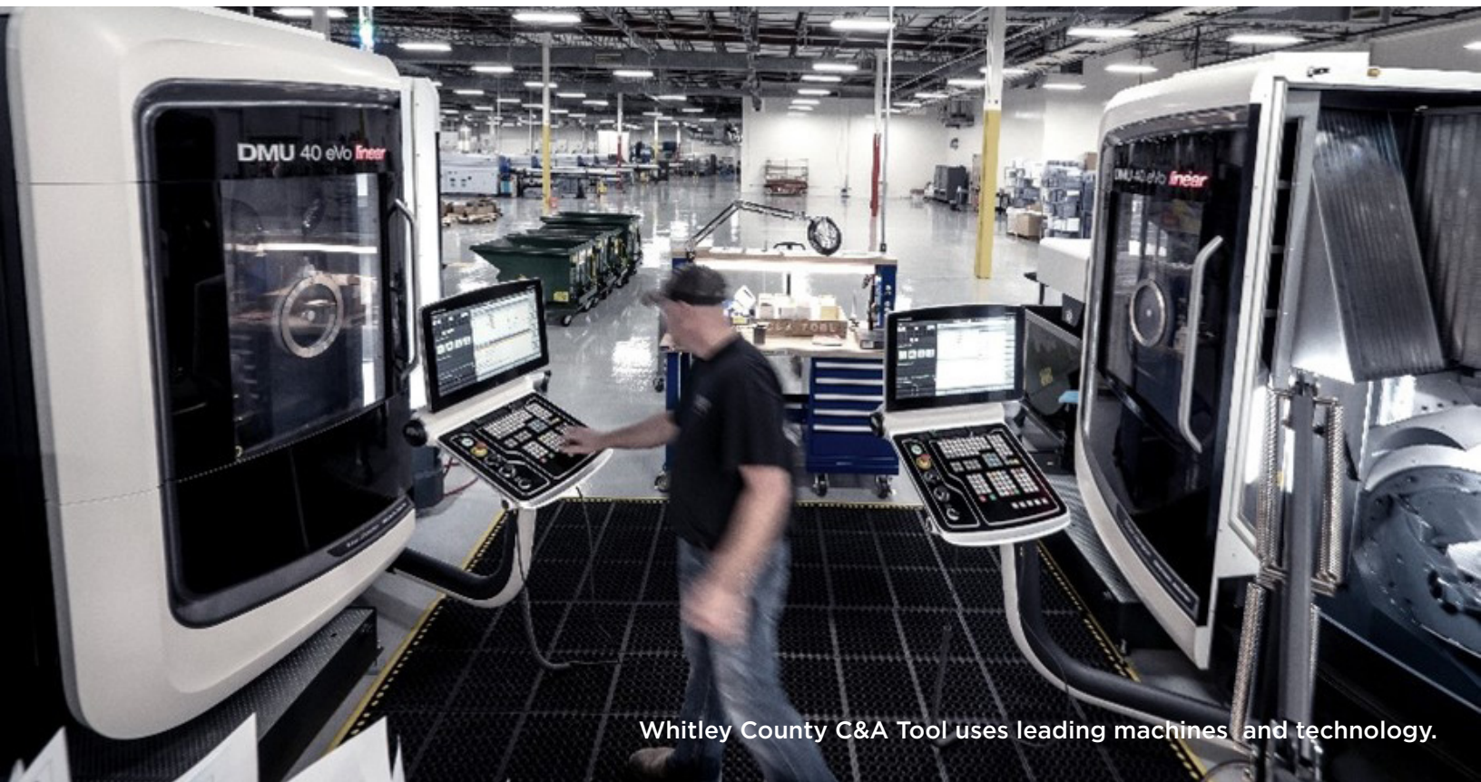
Whitley County C&A Tool uses leading machines and technology.